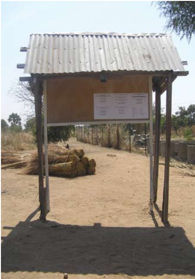
A noticeboard for beneficiaries in South Sudan