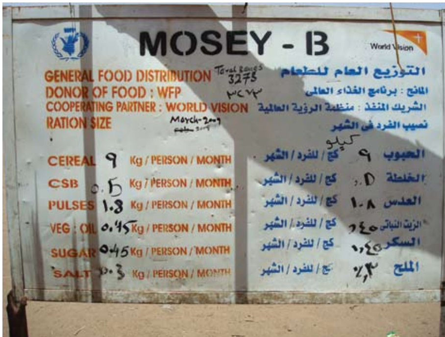
An information board in a displacement camp in South Darfur

to further harmonise their standards and approaches in order to use their leverage to more effect.