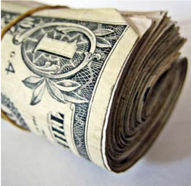
Images_of_money (via flickr)