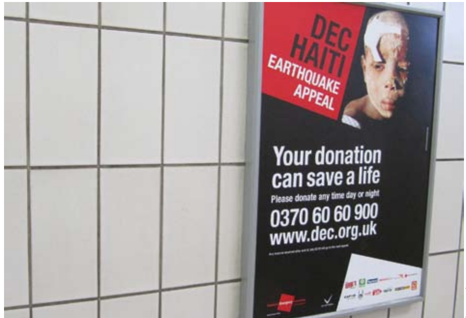
Howardlake (via flickr)