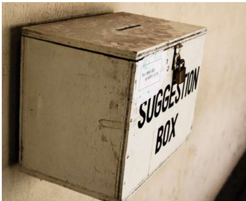
Hashmit