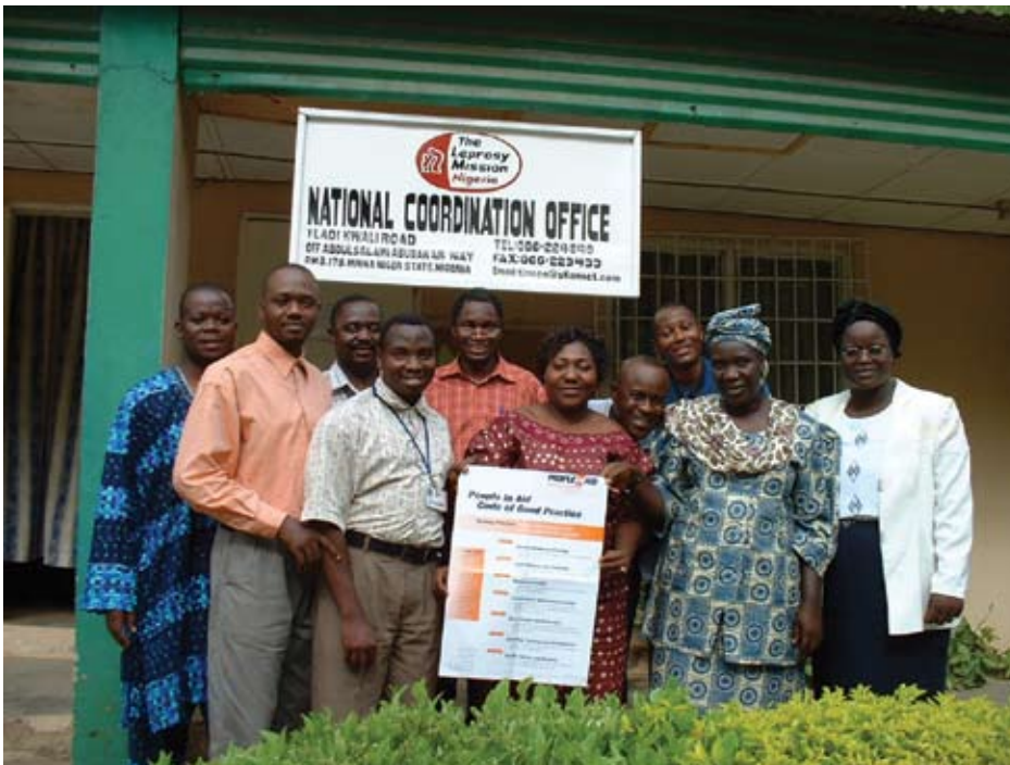
The Leprosy Mission in Nigeria, displaying the People In Aid Code of Good Practice

return on investment analyses to look at the people side of the organisation, on the operational side not enough is being done to use learning to bring about changes in practice. People in Aid looked at 56 recent humanitarian evaluations to see how staff issues were assessed. We found that references to human resource management were ad hoc and not systematically covered: 'The identification of HRM [human resource management] issues may depend on the interest and experience of the evaluator, only focusing on HRM when it has a noticeable impact on programme activities'. 10 People In Aid and ALNAP are working together to ensure that the forthcoming ALNAP evaluation guide includes