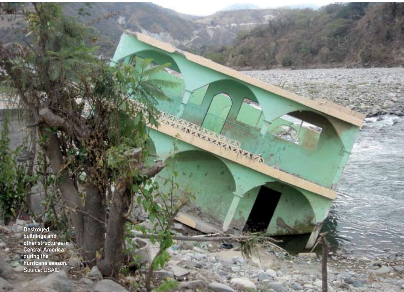
Destroyed buildings and other structures in Central America during the hurricane season.

The factor in the RTU Costa Sur that most hinders risk management is the lack of enforcement of construction codes and, thus, poor quality housing in an area with high population growth. It is also important to highlight the increased risk of floods associated with the influence of the agricultural export sector. Decisions to divert the trajectory of certain rivers, the production of waste and the construction of dykes to protect private farms, have led to flooding in surrounding rural communities and increased environmental pollution. Here it is worth mentioning that federal and municipal government authorities are unable or unwilling to control these processes.