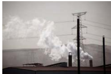
This photo taken on November 2010 shows smoke emitted from chimneys at a coal mine in Huo Lin Guo Le, China's north Inner Mongolia region. By 2030, climate change will indirectly cause nearly one million deaths a year and inflict 157 billion dollars in damage in terms of today's economy, according to estimates presented at UN talks on Friday.

"If emissions carry on their current pathway then we may in the longer term be headed for three or