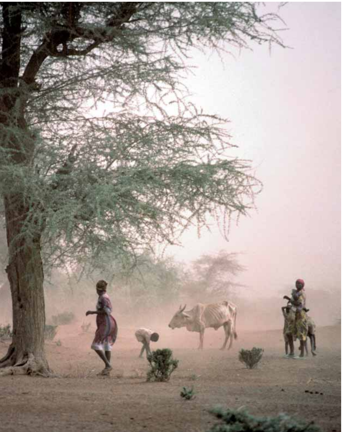
A sandstorm on the western shore of Lke Baringo, Kenya.