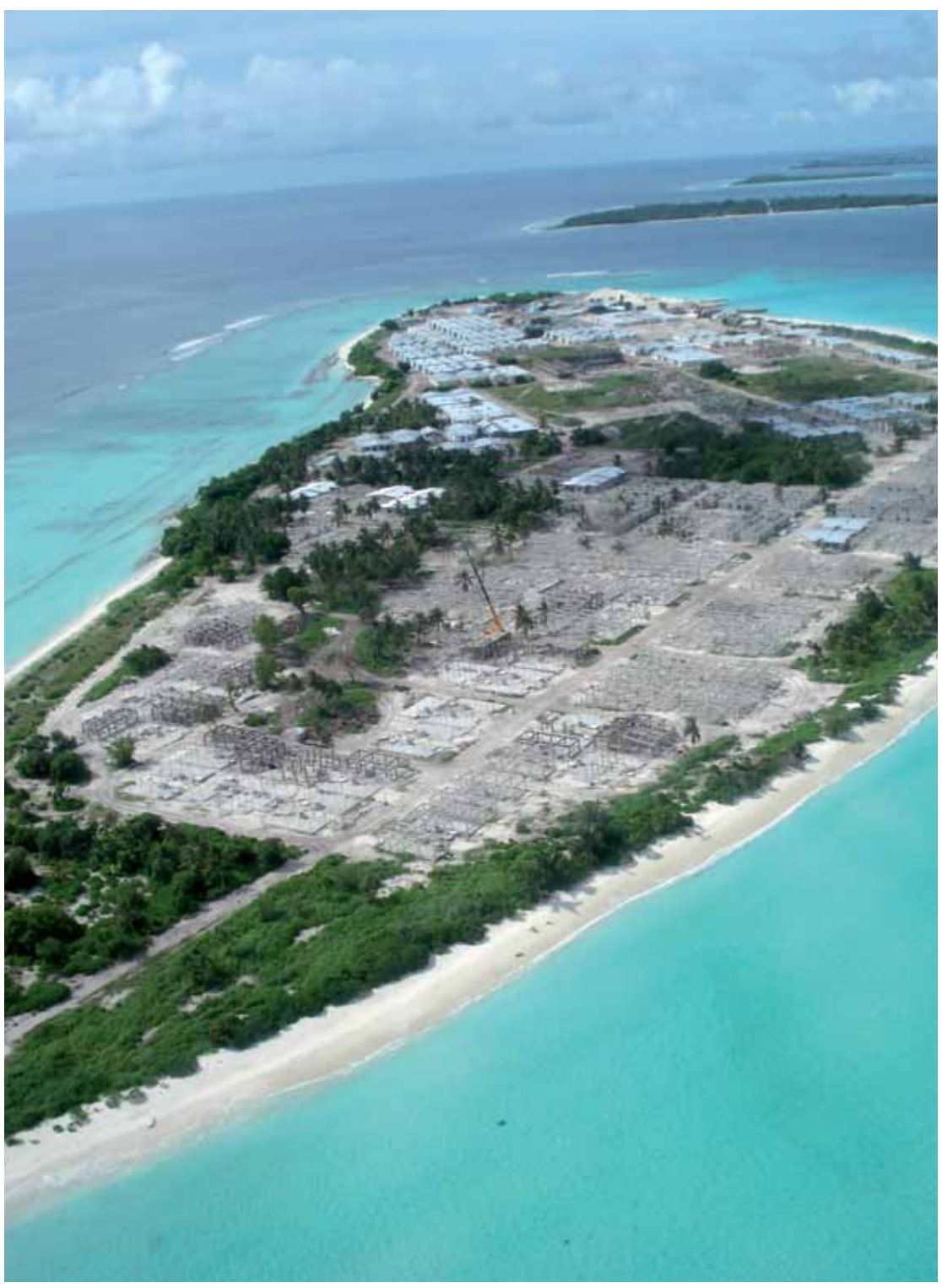
Redeveloping community in the Maldives.